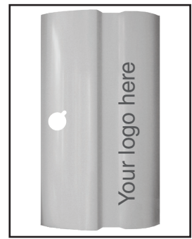
Panels can be customized in dozens of different ways, such as adding your company's logo.