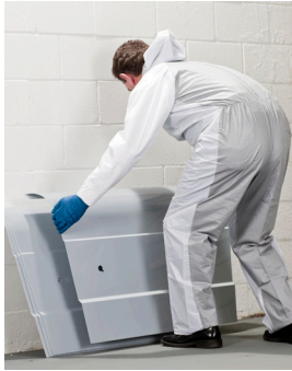
The Q-PANEL automotive refinishing training system is a cost-effective simulation of hoods and fenders.

These custom panels are most cost-effective when there are quantities sufficient to allow an economical production run, and when the material is available from our stock metal or readily available alloys. Contact Q-Lab with your custom panel specifications now!