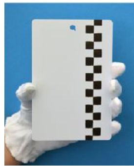
A variety of different pre-painted, patterned and other custom panels can be made upon request.